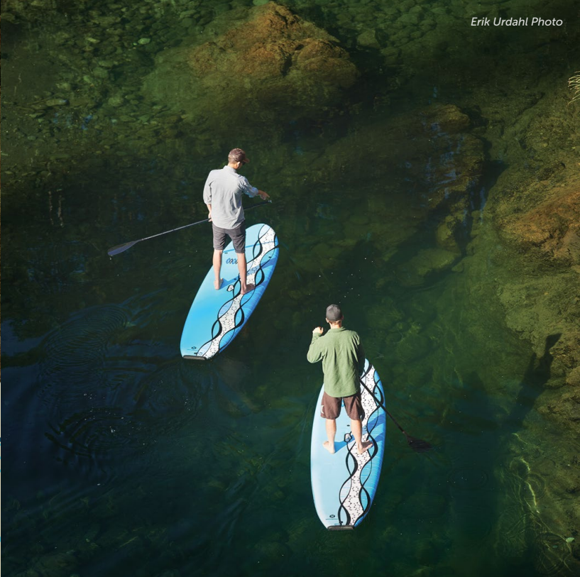
Erik Urdahl Photo