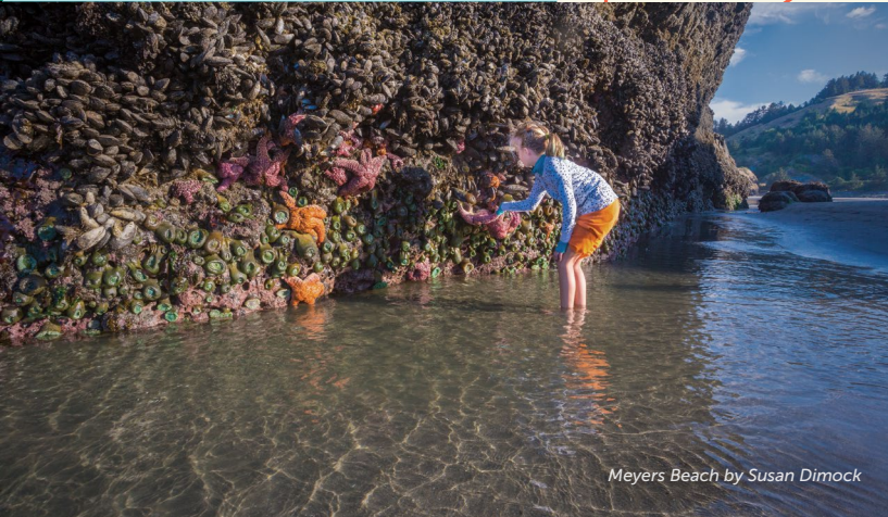
Meyers Beach by Susan Dimock