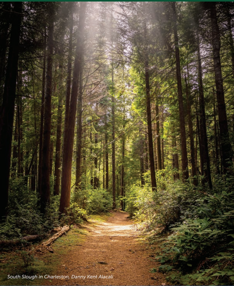
South Slough in Charleston, Danny Kent Alacali

Our rugged coastline offers up some incredible hiking with trails through ancient Sitka spruce that lead to peeks of the ocean and insane panoramic views.