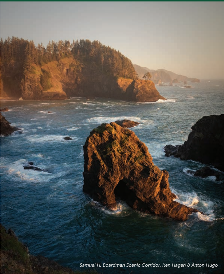
Samuel H. Boardman Scenic Corridor